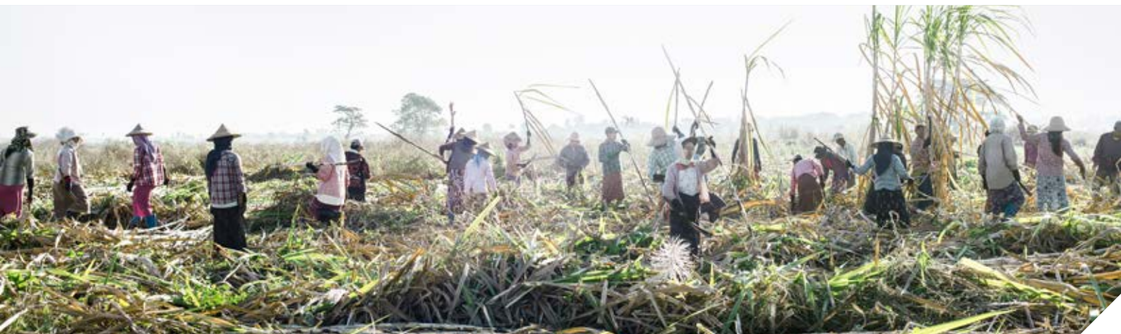
Maxime Fossat © ILO

A series of six case studies was conducted in Cameroon, China, Colombia, Indonesia, the Philippines and Tunisia. These studies set out to describe the national contexts, the impact of existing initiatives (both independent from and within ILO projects), and the challenges encountered during their implementation. Some of the initiatives described in the case studies are mentioned in this report as examples. Five of these case studies have been selected for publication under the title: Safety and health in micro-, small and medium-sized enterprises: A collection of five case studies .